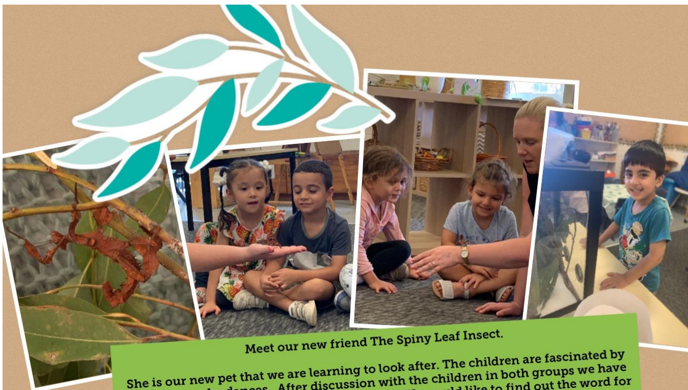
Meet our new friend The Spiny Leaf Insect. She is our new pet that we are learning to look after. The children are fascinated by her because she dances. After discussion with the children in both groups we have decided to call her 'Dancer' but not in English. We would like to find out the word for dancer in the languages of the preschool children. We will then have a vote on the name we would all like.