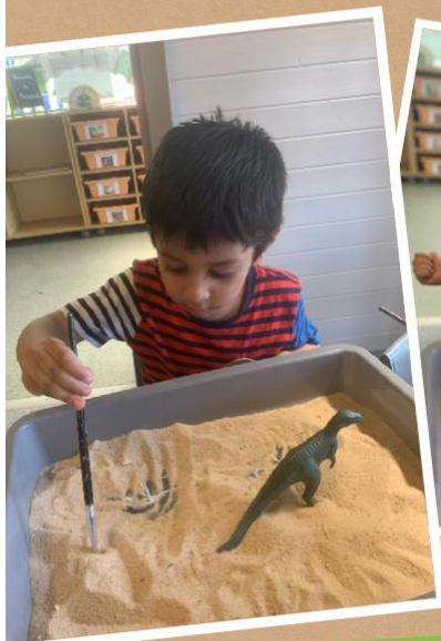
Our new resident archeologists digging for dinosaur bones. They needed to be so careful to use the brush to move the sand to find the bones.