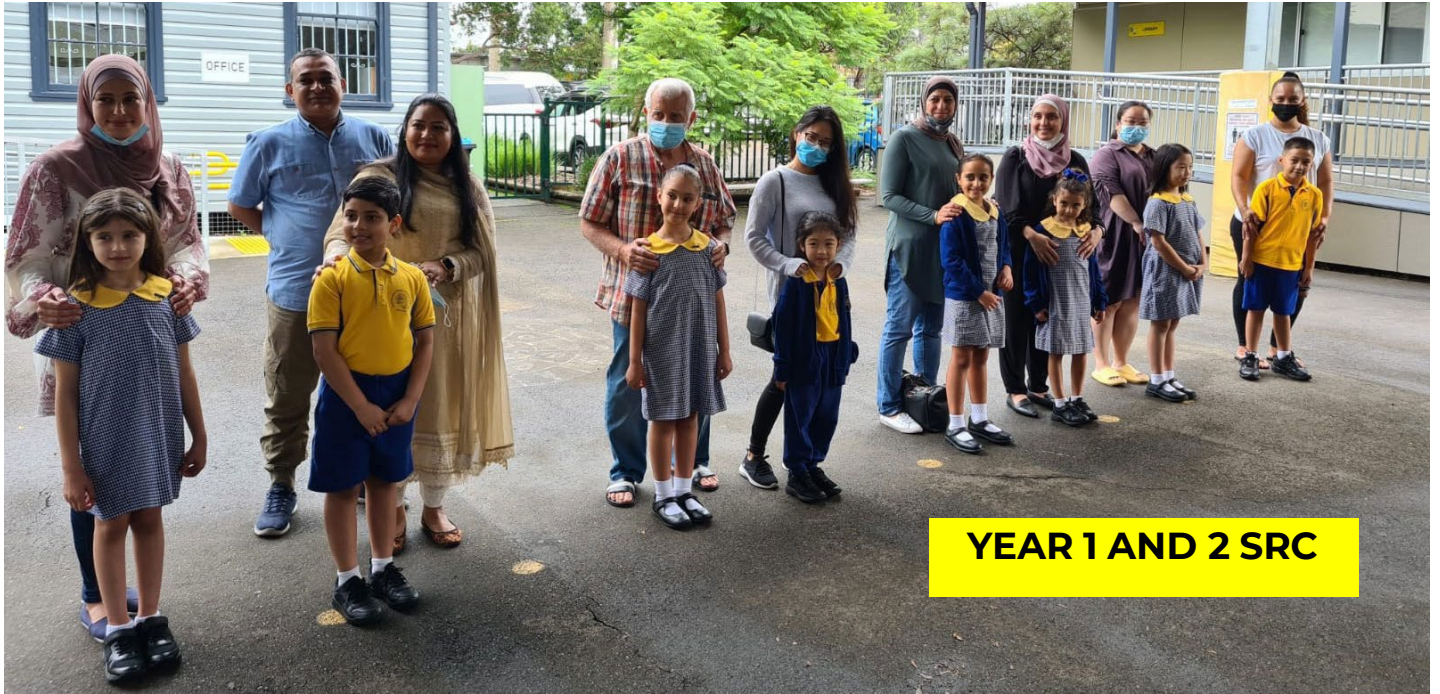
YEAR 1 AND 2 SRC

This week we held our 2022 SRC Badge Presentation Ceremony.