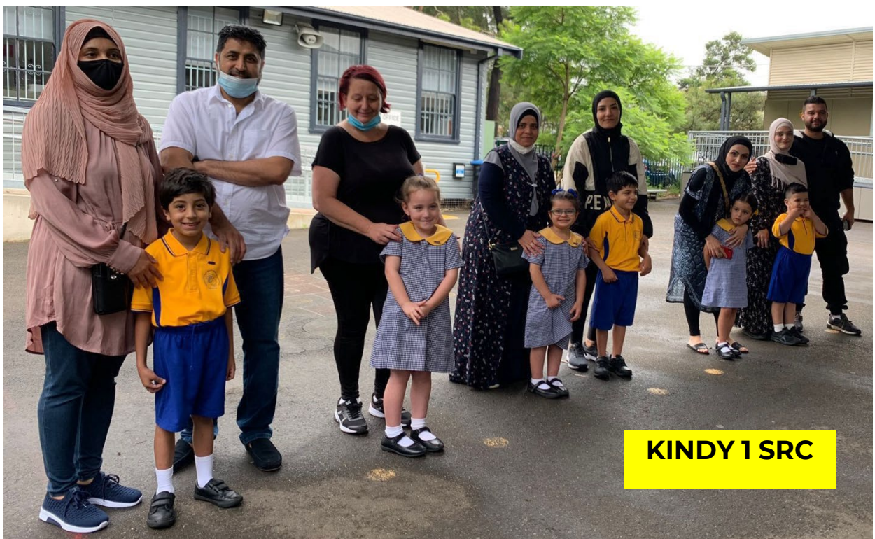
KINDY 1 SRC

It was a special occasion with family members participating in the ceremony and presenting their children with their badges.